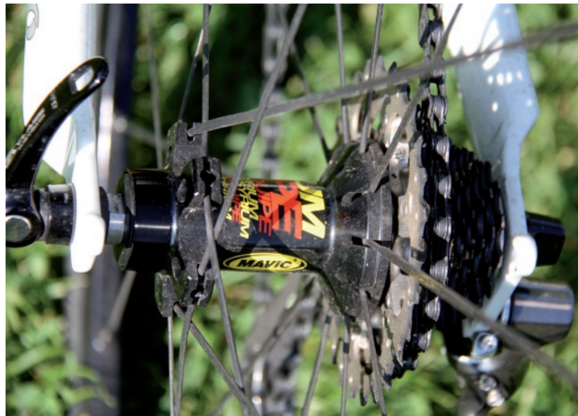
Flat spokes, beautiful Mavic hub, more nice details