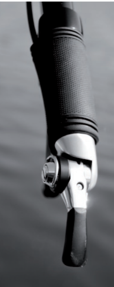
Bar-end shifters, so simple can it be.