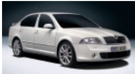
Škoda Octavia PS